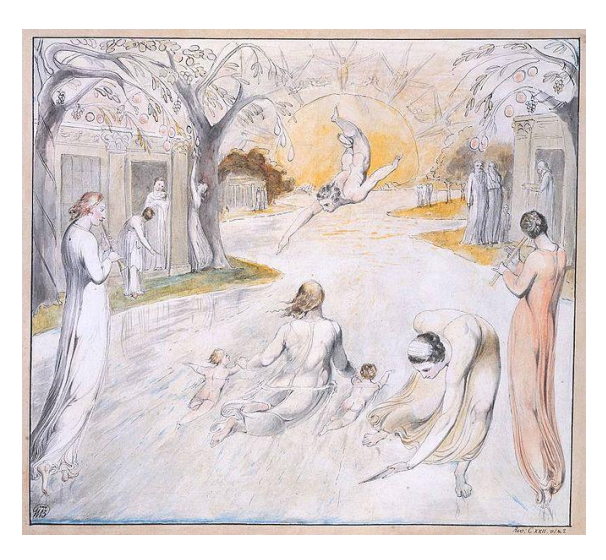
The Hidden Wilderness and Satan