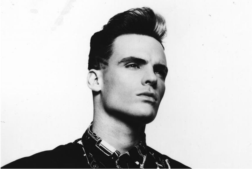
Robert Matthew Van Winkle was born in Dallas, Texas, on October 31, 1967. [7] Van Winkle has never known his biological father; he was given the family name of the man his mother was married to at the time of his birth. [8] When Van Winkle was four, his mother divorced.

The Wikipedia claims he was born in Dallas, Texas without making any mention of discrepancy, when in fact the 'Ice by Ice' autobiography insists that he entered the world in a Miami suburb. Well, which is it? The confusion was intentional. A driving point to the narrative is that Intel creates backstories for their actors all the time. With Vanilla Ice though they wanted you to see the sleight of hand for yourself, and even the Media was in on the act. What everyone does seem to agree upon is that he was born on Halloween in 1967 and that a biological father was never identified. Van Winkle derives from the family name of the man whom his mother was married to at the time of his birth, though their relationship only lasted a few years. After completing my Marilyn Monroe paper, I wouldn't be in the least bit surprised if Robby was American royalty and bred for a specific purpose. We are not told who the father is because it once again plays into the intended psyop.