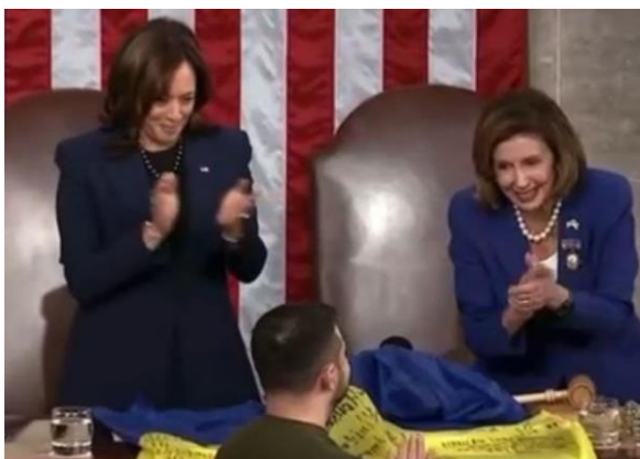
Get yourself a girl that looks at you the way Kamala Harris and Nancy Pelosi look at Zelensky.

I'm obviously not sure where this is going but it's all planned theater. I probably mentioned this a long time ago, but do you remember when President Trump kept saying: "I have done more in 47 weeks than Joe Biden has done in 47 years "? What do you suppose they have in store for the 47 number?]