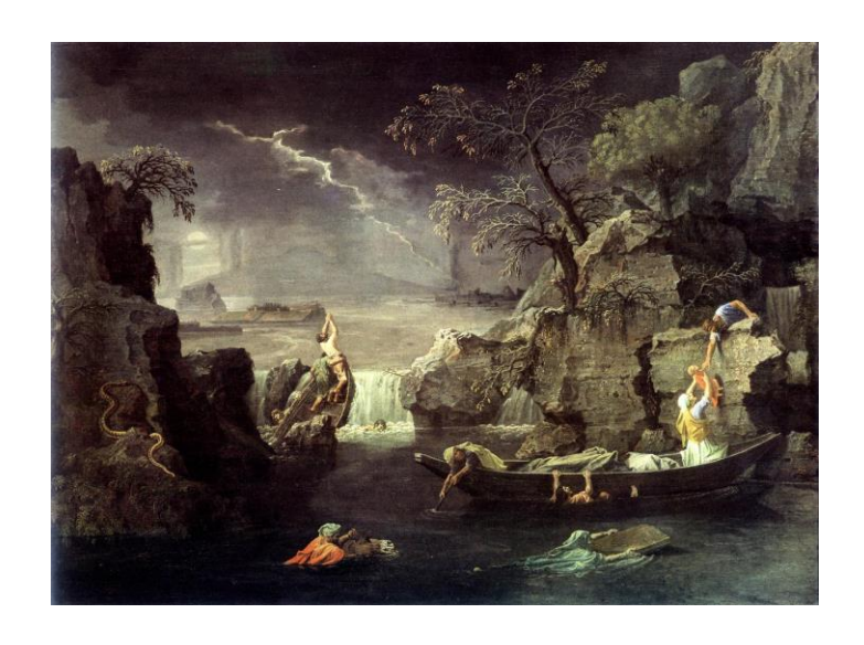
The Hyperborea Flood and the Flood of Enosh

VERY few people seem to realize that there are actually two separate flood accounts recorded within the Genesis timeline, and I can't blame them. The mention is so brief in Yashar that it managed to slip right on by me through several consecutive reads. Well, here it is.