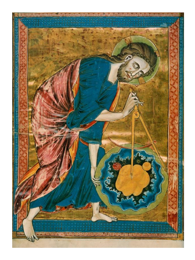
A Perfect Work

ENTIRE organizations of men are devoted to say that nothing noteworthy happened anywhere between the lines of Genesis chapter one. Particularly young earth Creationist ministries, as earlier mentioned. They will tell you that there is absolutely no curtain needing pulled, and that you are to mind your own business like a good boy. There are busts lining the halls of academia, representing minds far more brilliant than you. Let them handle it. Uncovering the hidden treasures contained within the Word is apparently the work of the naughty. I'm feeling naughty, are you? Let's have a go at the curtain pulling then, shall we? Jumping into our Bible's, we come upon the creation story as told by Kepha.