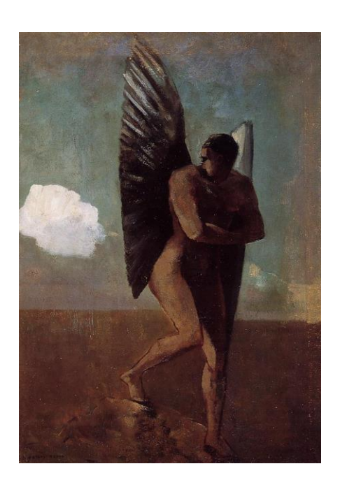
Destroyer of Worlds

UP to this point, I have yet to make any mention of the prince of Tyre. I do admit, for the first go-around, failing to add his puzzle piece into the picture was borderline neglect on my part. Wasn't oversight though. It was more like a lack of quarters for the parking meter, as I was running out of time to turn in a paper. Perfectionism is something I gave up in my twenties. But now that we have happened upon a second edition, I hope to remedy some of those simple oversights. You see, the Prince of Tyre, as found in Yechezq'el 28, may be our best glimpse into the lost world of Genesis 1:1. Certainly within the 66-Canon, anyways.